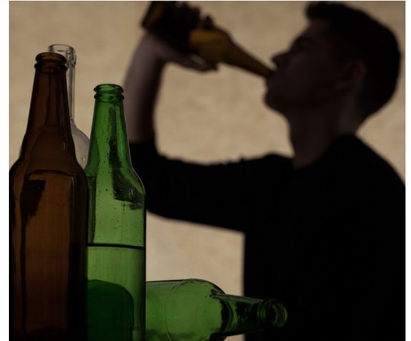
When the members of a group that is hazing become intoxicated, they may make disastrous decisions.