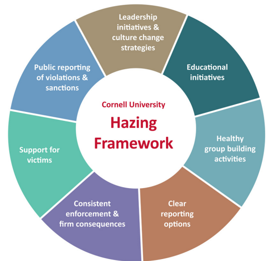
Cornell's comprehensive public health approach to hazing

and well-being of students (undergraduate, graduate, and professional) as a foundation for academic and life success."